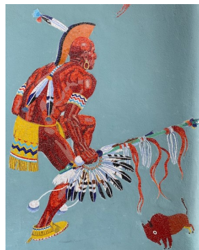
Entrance, Woolaroc Museum