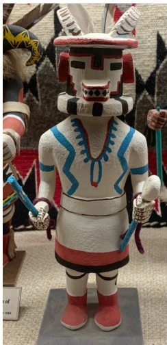
Pong Kachina, (Mountain Sheep)