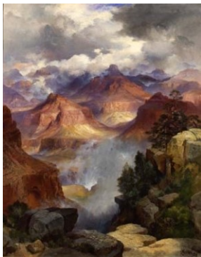
Grand Canyon, Thomas Moran