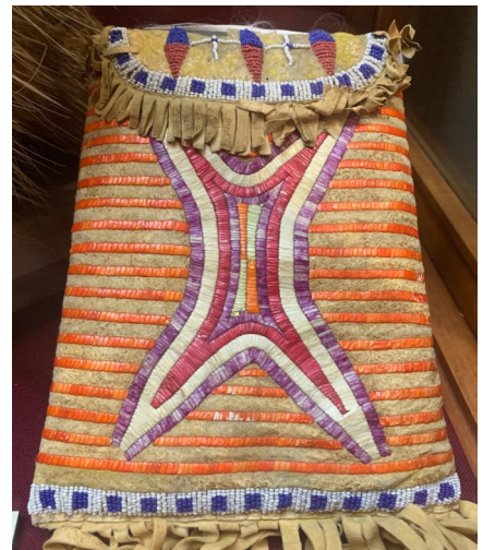
Quilled Bag, Sioux